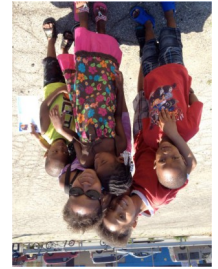
Photos from the Matrix Block Party

On Saturday, July 21, Starr Detroit Academy will host an orientation and block party at our school campus located at 19360 Harper Avenue. The event kicks off at 10:30 a.m., for kindergarten families with a kindergarten Roundup. Attendance is mandatory for families of kindergartners to secure their enrollment at Starr Detroit Academy. Families will meet their teachers, complete outstanding paperwork and learn more about the expectations for kindergarten students and parents. At noon on Saturday, July 21, families of first through fifth grade students are invited to attend the Block Party. In addition to food, entertainment, games and give-aways, this Block Party offers Starr Detroit Academy families the opportunity to purchase uniforms, complete required school forms, learn their child's school bus pickup/drop off information, and meet teachers and other school staff. Families can also learn more information about SDA's academic program and school culture. Come out and have a great time while learning more about your child's school and preparing for the upcoming school year.